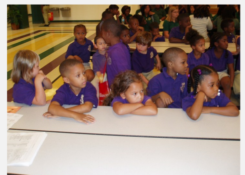
Students waiting for their backpacks