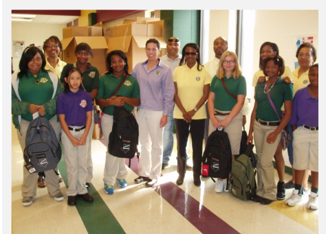
River Parish Kiwanians with Principal and students of Emily C Watkins Elem School