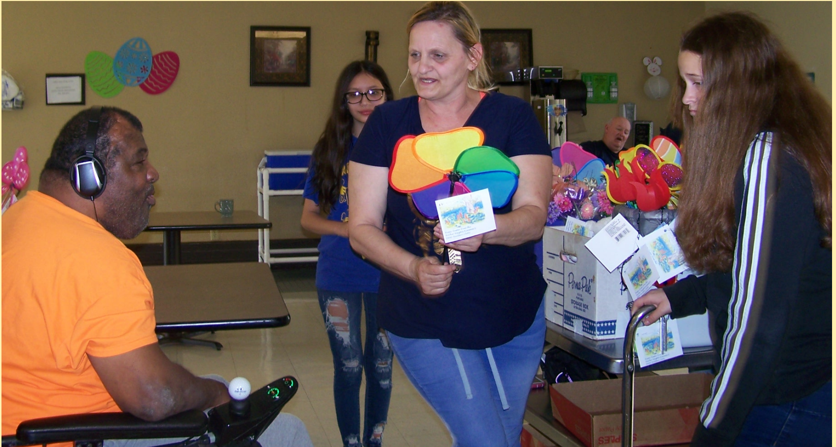
EHMS Builders Club brought colorful Easter gifts to brighten the spirits of the residents in the local nursing home

The Eastern Hills Middle School Builders Club paid a visit to the local nursing home and brought Easter gifts for the residents. It brought a big smile to the residents faces.