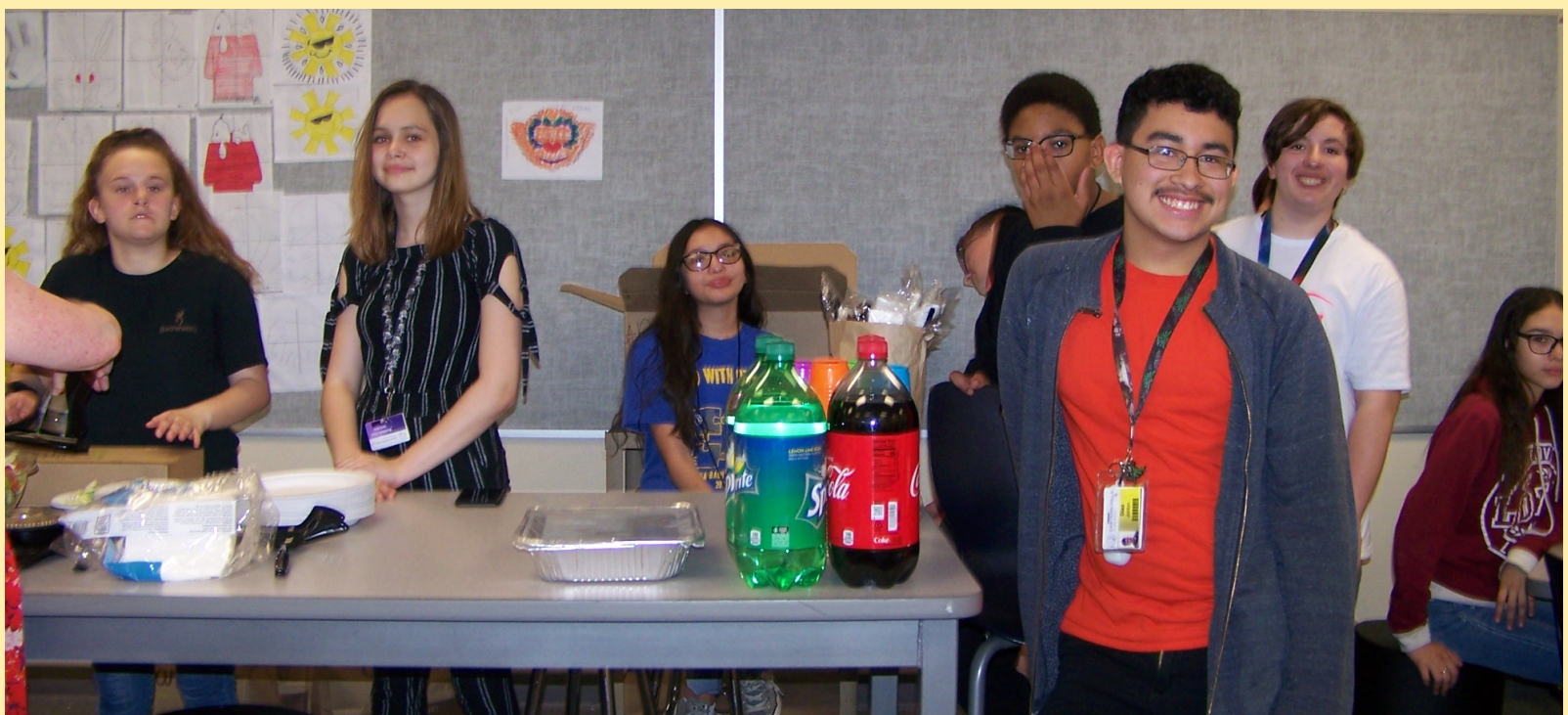
Builders Club members served a lunch from Olive Garden to the winning 6th grade class who raised the most money for the Leukemia & Lymphoma Society Fundraiser

Each year the Builders Club has a school wide fundraiser for the Leukemia & Lymphoma Society and partners with Olive Garden to have a spaghetti, salad & bread stick lunch for the winning class.