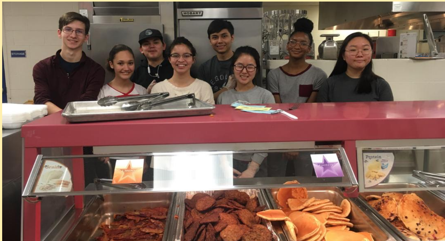
HHHS Key Club ready to serve at the Pancake Supper

The Kiwanis Club of Harker Heights has had a very busy winter and spring. The first event was the 48th annual pancake supper held at the Harker Heights Elementary School.