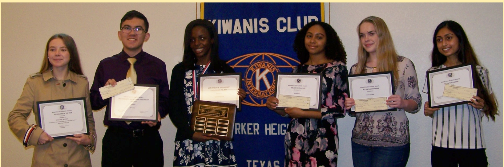
(5) $1,500 Scholarship winners from Harker Heights High School

The Harker Heights Kiwanis Club awarded (5) $1500 scholarships to Harker Heights high school seniors at the May 14th meeting. The school principal, guidance counselors, JROTC instructor, other supporting teachers and community leaders attended the luncheon to support these outstanding students. Also recognized at the luncheon was the TX/OK Sophomore of the Year competitor and the first ever Gen. Robert M Shoemaker Citizenship Award recipient.