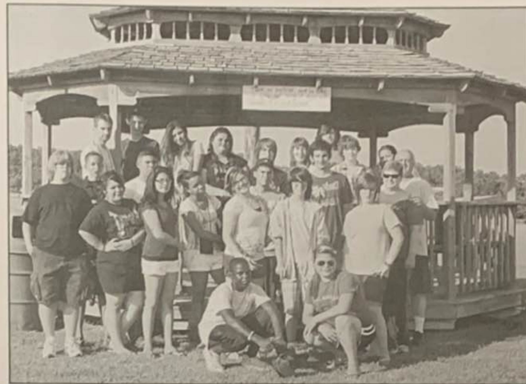
Twenty high energy Key Club members from Pathways Middle College High School, Oklahoma City, OK attended the Key Leader camp in Quapaw, Oklahoma on June 3-5, 2011. They were part of a group of 60 youth in attendance for the camp. These students came to learn how to work better as a team and as a school. They were sponsored by the Southwest OKC Kiwanis and the Tahlequah Kiwanis Clubs. Pathways students came to learn what service leadership is and how to best demonstrate it in their community.