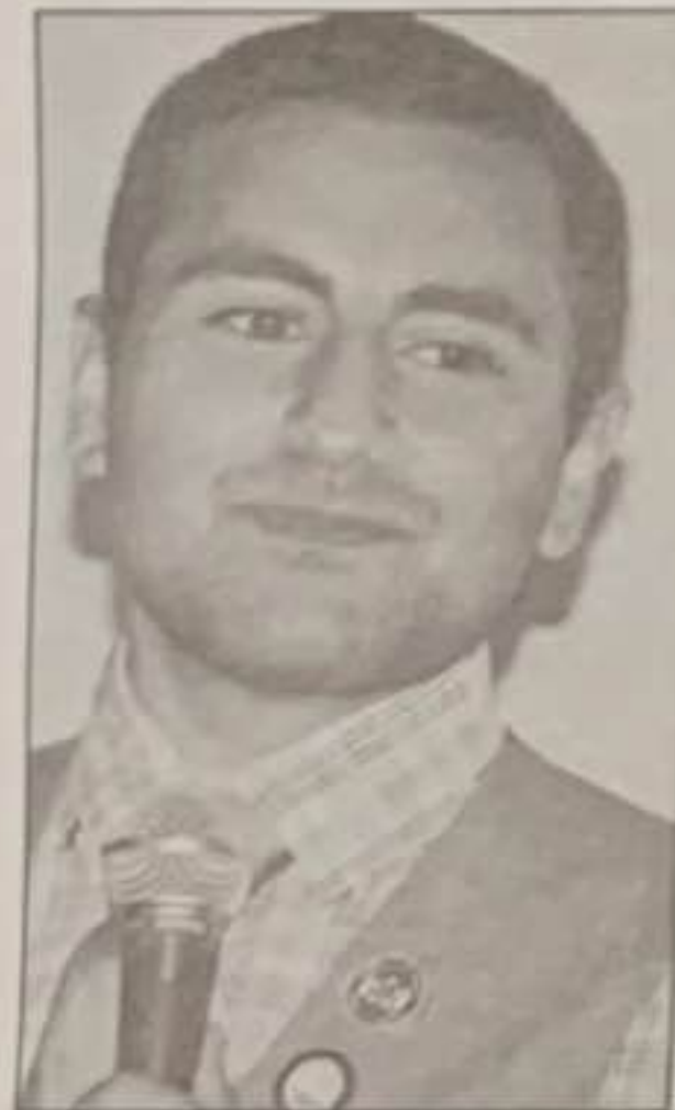
Circle K Gov. Donnesh Amrollah asked Kiwanians to reach out to their Key Clubs and Circle K Clubs.