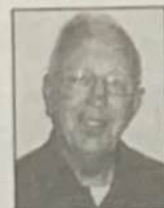
T-O Kiwanis First Timer at Kiwanis International Convention