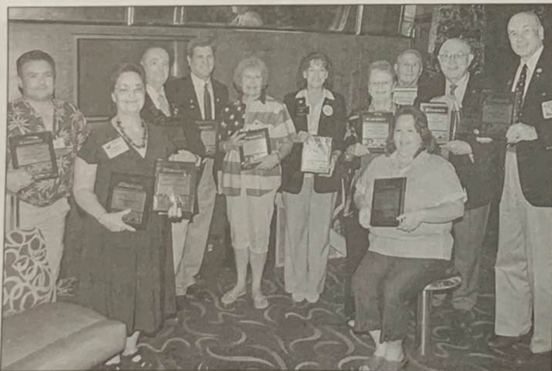
Members of this group were either editors of winning district or division bulletins, or webpages, or receiving the awards on behalf of winning editors. See results of this contest and the website contest on page 7.