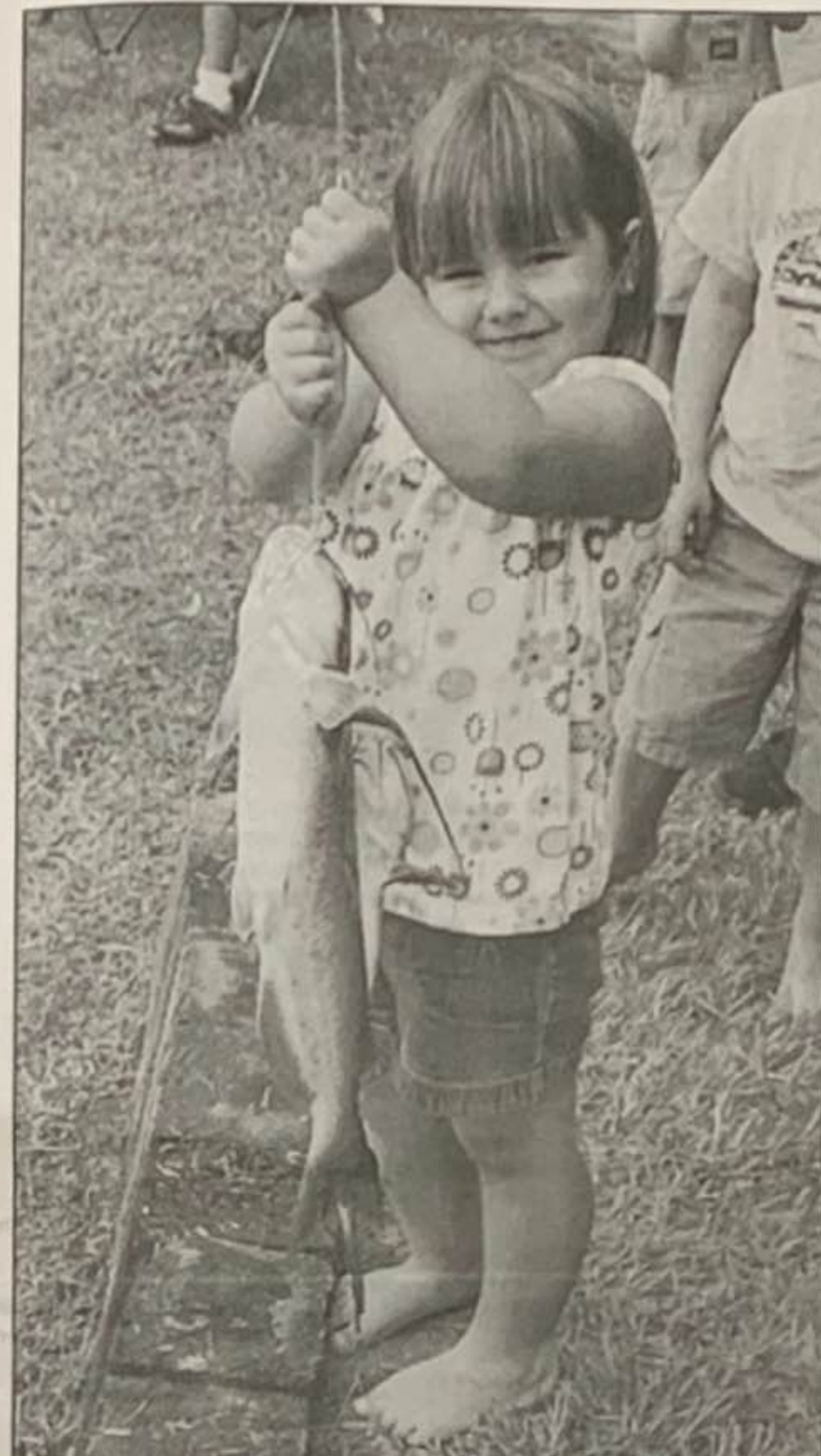
The Kiwanis Club of Woodlands, Texas, hosts an annual Kids Fishing Tournament. This year, the tournament was September 3 and marked the 28th annual event. The tournament is held for toddlers through 16 years of age, and trophies are awarded to all. There are usually over 150 kids and their families expected to the event to enjoy free food, drinks, and bait.

ing nonprofit organization for pregnancy and baby health. With chapters nationwide and its premier event, March for Babies the March of Dimes works to improve the health of babies by preventing birth defects, premature birth and infant mortality. Visit marchofdimes.com or nacersano.org .