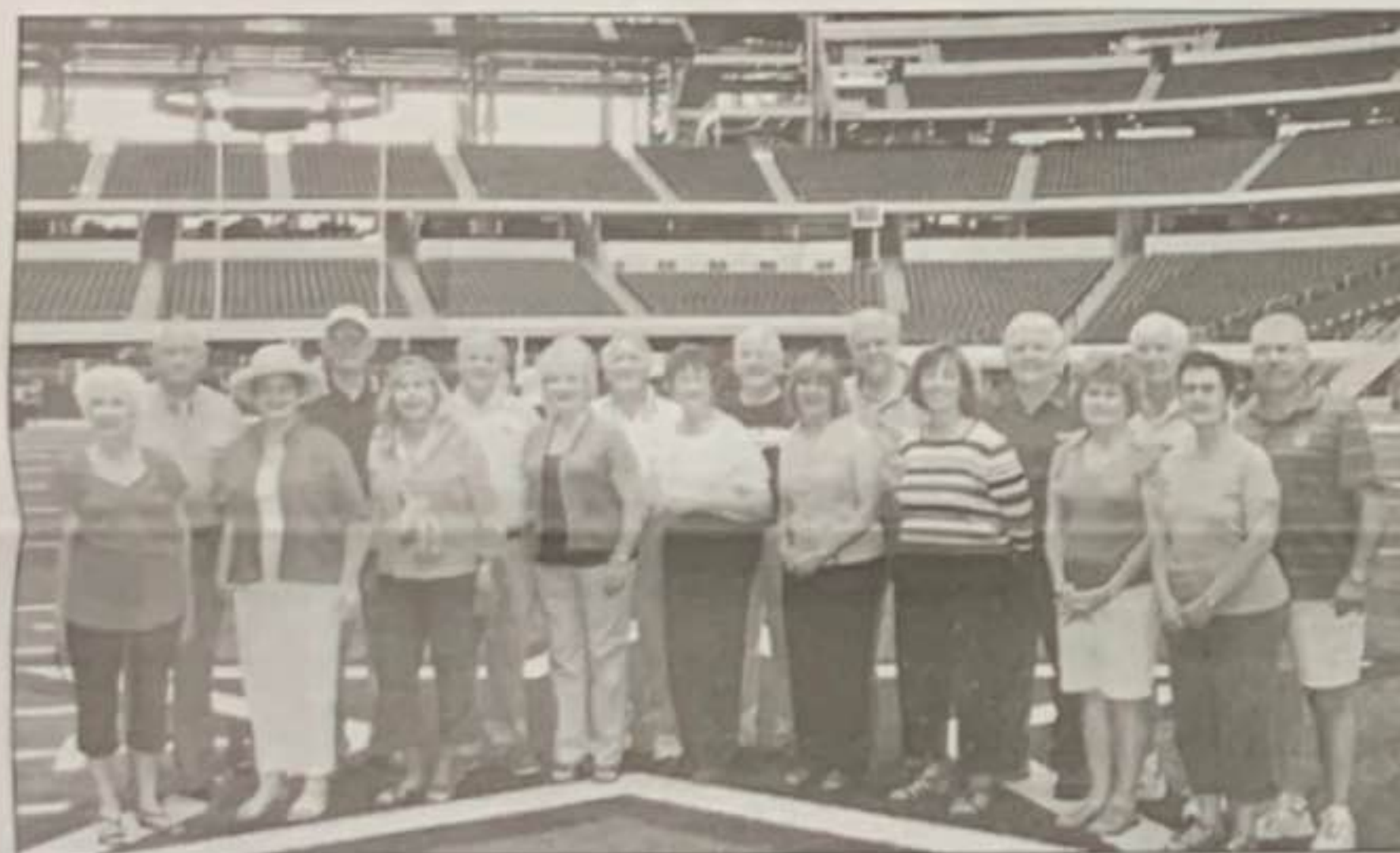
Twenty-one Kiwanians and guests took the Cowboys up on their offer to tour the new stadium at a special rate. Part of the tour price was donated to the Texas-Oklahoma Kiwanis Foundation.

BRING A NEW PAIR OF SHOES OR SOCKS! Key Club members will be helping to collect new shoes and socks for the Governor's Project Shoes for Orphan Souls.